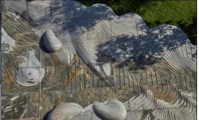
Embracing Indigenous heritage through public spaces | Brickworks