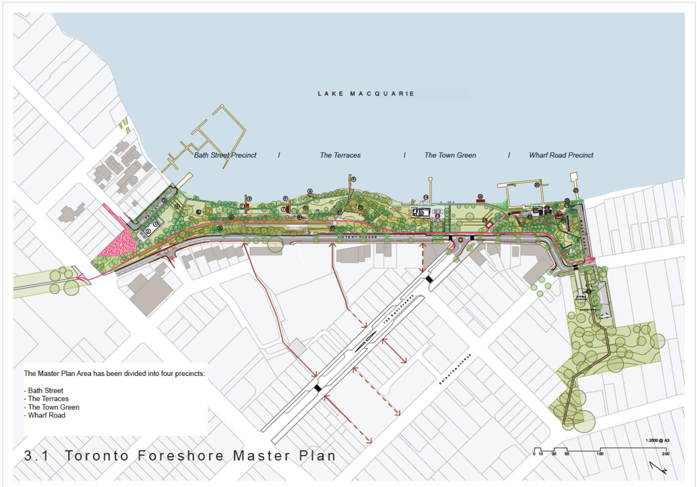
Toronto foreshore site and urban/landscape map