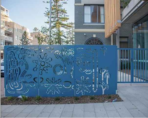
Manly | ChiaroScreens