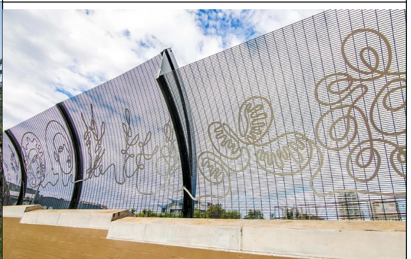
Cleveland Street Bridge Public Art Installation | BALARINJI Indigenous Design and Strategy