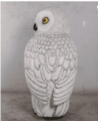
Snowy White Owl 5ft tall (152.4cm)